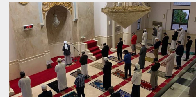
Musalees attend congregational prayers countrywide after two months. On the picture is seen musalees keeping social distancing inside a Johannesburg mosque when ban on mosque attendance was lifted.

First National Bank Al Jama-ah 6215 3667 575 Baytul Maal