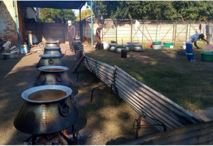
Soup kitchen in Pietermaritzburg headed by Councillor Goga