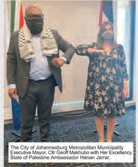
The City of Johannesburg Metropolitan Municipality Executive Mayor, Cllr Geoff Makhubo with Her Excellency State of Palestine Ambassador Hanan Jarrar.

Party Councillor, Thapelo facilitated a meeting between the mayor and the ambassador.