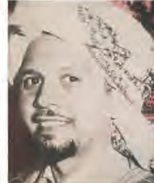
Imam Abdullah Haron was murdered on 27 September 1969.

"To allow for families to meet in a genuine case of reconciliation."