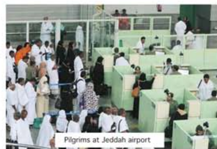
Pilgrims at Jeddah airport

"I will, in addition, propose a motion in parliament concerning visa-free reciprocal arrangements," he said.