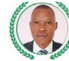
KABELO GWAMANDA CITY OF JOHANNESBURG Mayor