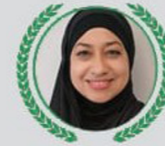
SHAMEEMAH SALIE CITY OF CAPE TOWN Al Jama-ah National Spokesperson Proportionate Councillor City of Cape Town